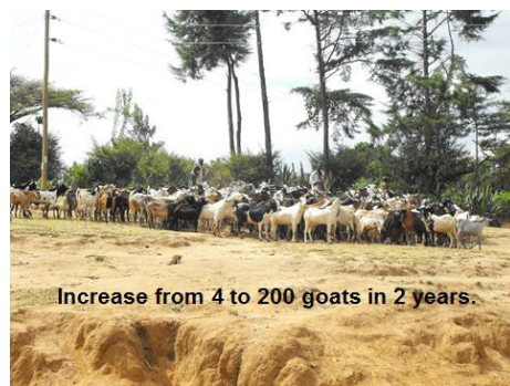
Increase from 4 to 200 goats in 2 years.