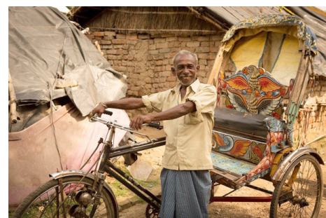
A cured leper now sustains himself