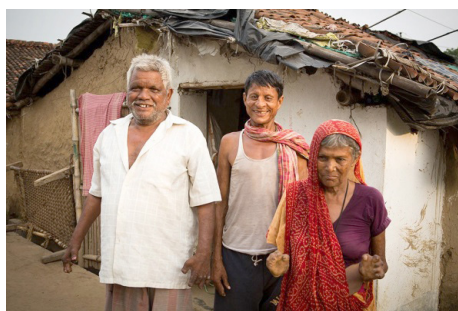
Prem Nagar colony residents welcome visitors with a warm smile.

leper completely (including surgery if needed) and give him/her a NEW life.