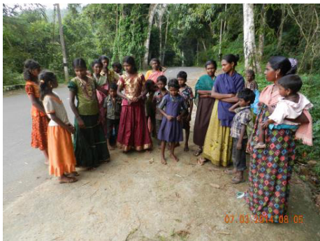
They are all uneducated. These people live in the shack on the right.

M ATE/FCC is involved in rescuing 11 and 12 years old girls who run away from home to escape getting married to men who are 50 or 60 years of age, because of poverty. They seek refuge and in the process get an education. Your