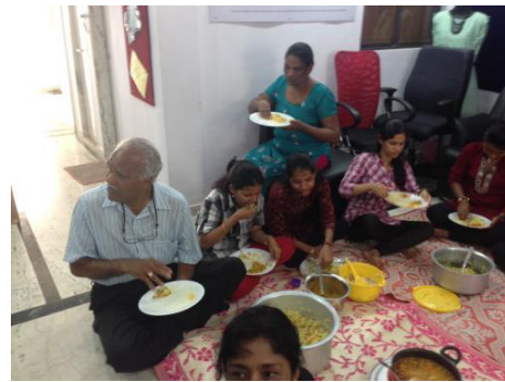
Sharing a meal with rescued girls.

Thank you for your time and for the opportunity to share what God is doing through MATE/FCC all these years. We are living in difficult times but our God is able when we trust Him with what He has entrusted us to do. Please ask Him how you can help in breaking the chains of poverty! Please call 905-479-6185 or write to MATE/FCC, P.O. Box 20060, 2900 Warden Ave. Scarborough, ON M1W 4B6 to help us in this endeavour.