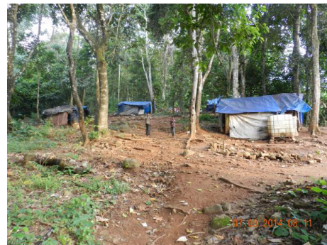
A family lives in each of these tents

Also, MATE/FCC is involved in rehabilitating rescued girls from the "red light district" (sex trade) and teach them to read and write, learn