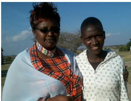
Most recent rescued girl with MATE/FCC Rep.