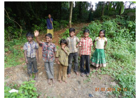
What future do these children have without our help?

Again, we need your help to provide food, accommodation, clothes, fees for counseling and education.